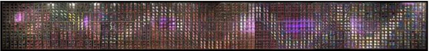
Snake2 'The entire Snake by Sir Sidney Nolan'