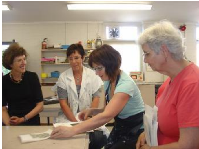
at the Solar Print Workshop

The participants learned three different ways of making marks on the solarplate and then used their new skills and ideas to develop a larger plate on the second day. By Sunday afternoon, everyone had produced a least one print they were pleased with, and, as often happens in these workshops, some had churned out whole editions.