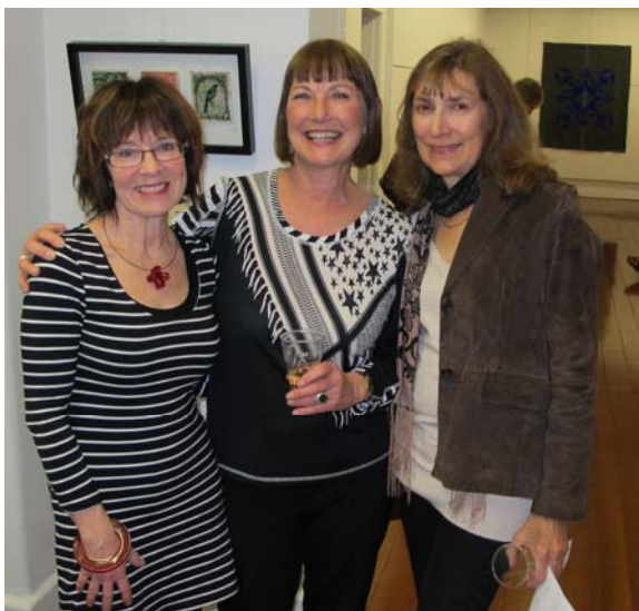
A trilogy of WSA artists & organisers